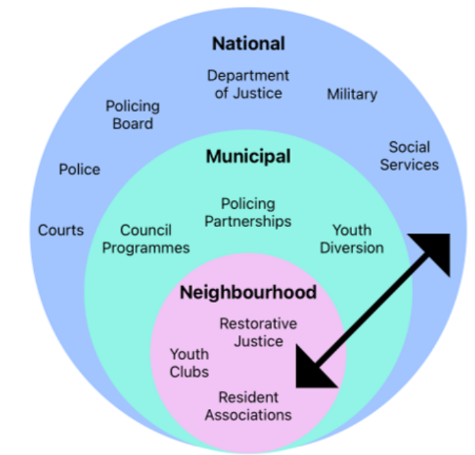
Figure 2: A depiction of the multi-level security field with example actors and organisations.

The remainder of the workshop focused on the concept of a 'security field'. This idea draws on Bourdieu's theory of a field as a network or configuration of actors, with tensions sometimes arising between powerful actors and dominated actors over access to resources. We therefore envision the security field as a multi-level arena, based upon actors' positions in relation to resources and power, who help contribute to the maintenance and provision of everyday safety, including both statutory and non-statutory actors. The research team was interested in hearing participants' ideas about which organisations and actors might exist and interact within this field.